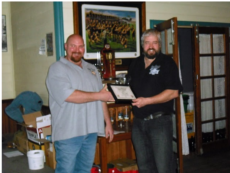
Best English Pale Ale