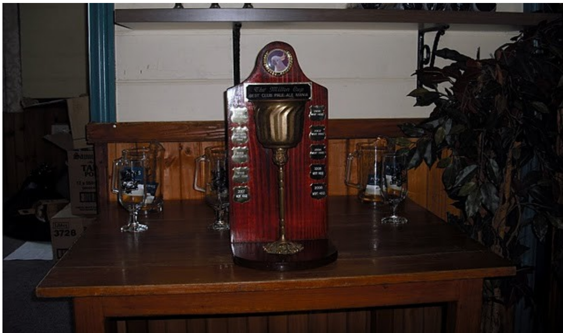
The Milton Cup